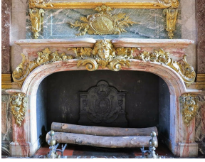
Exceptionnal fireplace in Sarrancolin Fantastico ornamented with gilt bronzed in Hercules salon, Versailles Castle.

In the town of Sarrancolin -like in Campan-, a small village in the Hautes-Pyrenees, several varieties of marbles are extracted since the Middle Ages. Those quarries knew their greatest glory during the reign of Louis XIV . The Sarrancolin marbles have all red flaming patterns but Sarrancolin Fantastico has a special pink-beige dominant tone. The Sarrancolin marbles can be found in the most prestigious staterooms of Versailles. It has been used for the large fireplace in the Hercules Salon, made under Louis XV and richly decorated with gilt bronzes.