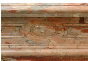
Very elegant Régence style Sarrancolin marble mantel - Detail of the front.