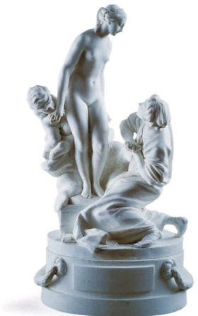
Pygmalion and Galatée, Royal Manufacturer of Sèvres, bone china, 1763, Musée des Arts Décoratifs, Paris.