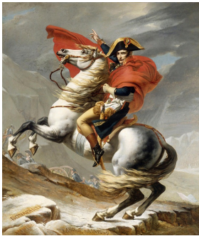
Bonaparte franchissant le Grand-Saint-Bernard, portrait painted by Jacques-Louis David, between 1800 and 1803, Musée national of the Château de Malmaison, Rueil Malmaison.