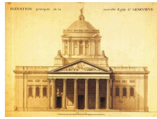
Main elevation of the new church of Sainte-Geneviève, drawn by Soufflot after 1764, Archives nationales, Paris.