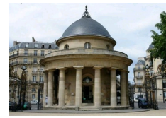
The Barrière de Chartres Rotunda, by Claude-Nicolas Ledoux, for the Wall of the Ferme générale, 1786-1792, parc Monceau, Paris.