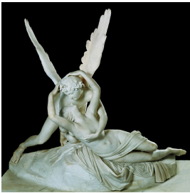
Antonio Canova, Psyche Revived by Cupid's Kiss, 1793, Musée du Louvre, Paris.