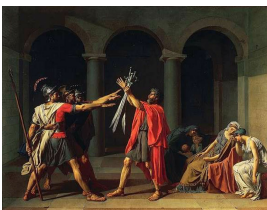
The Oath of the Horatii, Jacques Louis David, 1784, Musée du Louvre.