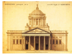
Main elevation of the new church of Sainte-Geneviève, drawn by Soufflot after 1764, Archives nationales, Paris.