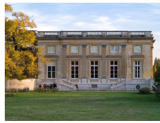
Petit Trianon, Versailles, Jacques Ange Gabriel 1762-68