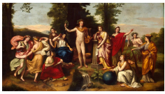
Raphaël Mengs, Parnassus, Villa Albani, Roma, middle of the 18th century.