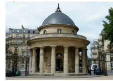
The Barrière de Chartres Rotunda, by Claude-Nicolas Ledoux, for the Wall of the Ferme générale, 1786-1792, parc Monceau, Paris.