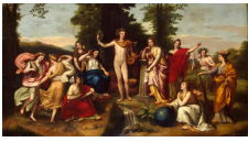
Raphaël Mengs, Parnassus, Villa Albani, Roma, middle of the 18th century.