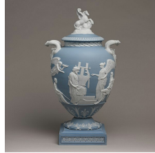
Vase designed by John Flaxman, crafted by the Josiah Wegwood and Sons factory, 1782-1790, Metropolitan Museum, New-York City.