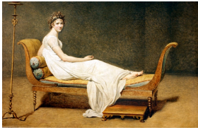
Jacques-Louis David, Portrait of Madame Récamier, 1800, Musée du Louvre, Paris.