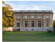
Petit Trianon, Versailles, Jacques Ange Gabriel 1762-68