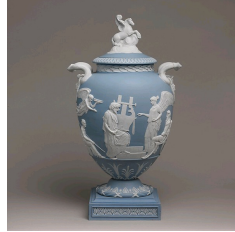
Vase designed by John Flaxman, crafted by the Josiah Wedgwood and Sons factory, 1782-1790, Metropolitan Museum, New-York City.