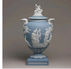
Vase designed by John Flaxman, crafted by the Josiah Wedgwood and Sons factory, 1782-1790, Metropolitan Museum, New-York City.