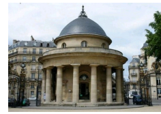
The Barrière de Chartres Rotunda, by Claude-Nicolas Ledoux, for the Wall of the Ferme générale, 1786-1792, parc Monceau, Paris.