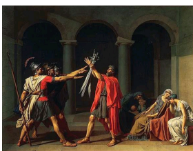
The Oath of the Horatii, Jacques Louis David, 1784, Musée du Louvre.