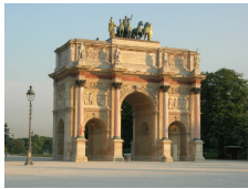
Arc de Triomphe of the Carrousel in the Louvre by Charles Percier and Pierre-François-Léonard Fontaine in 1809.