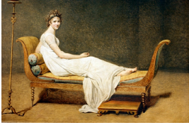
Jacques-Louis David, Portrait of Madame Récamier, 1800, Musée du Louvre, Paris.