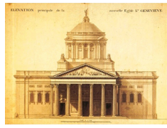
Main elevation of the new church of Sainte-Geneviève, drawn by Soufflot after 1764, Archives nationales, Paris.