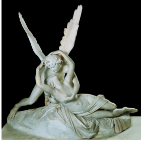
Antonio Canova, Psyche Revived by Cupid's Kiss, 1793, Musée du Louvre, Paris.