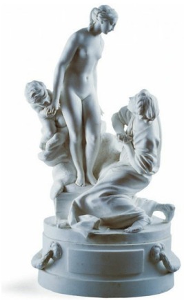
Pygmalion and Galatée, Royal Manufacturer of Sèvres, bone china, 1763, Musée des Arts Décoratifs, Paris.