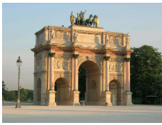
Arc de Triomphe of the Carrousel in the Louvre by Charles Percier and Pierre-François-Léonard Fontaine in 1809.