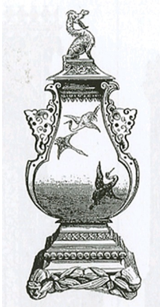
Picture 13 : World's Fair of 1878, the Royal Porcelain Works of Worcester directed by R.W. Binns offered Japanese style porcelain.