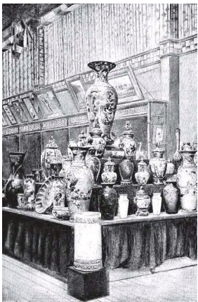
Picture 4 : Japanese ceramics in the Japan Pavilion, World's Fair of 1889 in Paris.