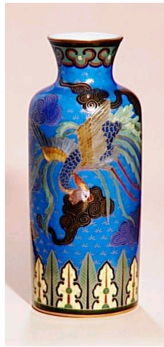
Picture 8 : Vase, Escalier de Cristal, circa 1880. Orsay Museum, Paris.