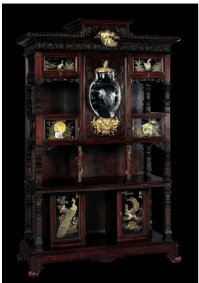
Picture 5 : Display Cabinet by Gabriel Viardot, circa 1895, Corning Museum of Glass, United States.

"When I said that Japonisme was in the process of revolutionizing the vision of the European peoples, I meant that Japonisme brought to Europe a new sense of color, a new decorative system, and, if you prefer, a poetic imagination" (Edmond de Goncourt, Journal , April 1884)