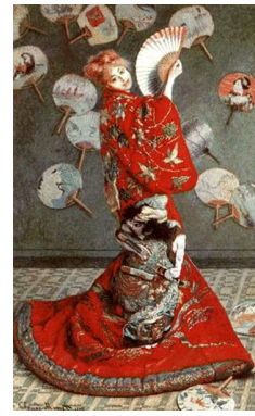
Picture 10 : Claude Monet, The Japanese Lady, 1876, Museum of fine Arts, Boston