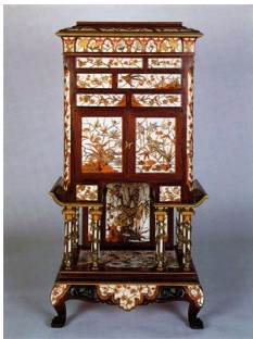
Picture 7 : Cabinet, Ferdinand Duvinage, circa 1880. Orsay Museum, Paris.