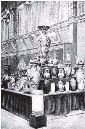
Picture 4 : Japanese ceramics in the Japan Pavilion, World's Fair of 1889 in Paris.