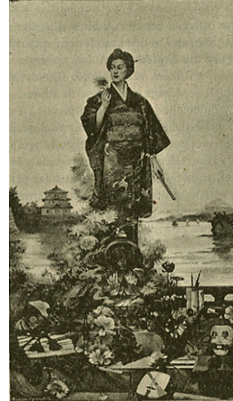
Picture 15 : Decorative panel, by Louise Abbéma (1853-1927).