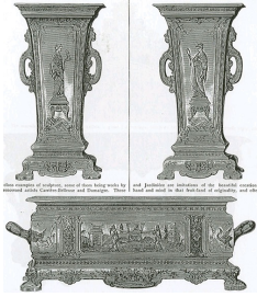
Picture 12 : World's Fair of 1878, Paris, the Blot & Drouard Company presented these two Japanese style vases and planter.