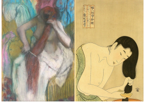
Picture 1 : Edgar Degas, Woman combing hair, 1900 ; Kitagawa Utamaro, Bijin combing hair, 1801