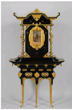
Picture 6 : Two bodies cabinet, Édouard Lièvre, 1877. Orsay Museum, Paris.