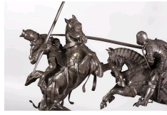
Count de Nieuwerkerke, The Death of the Duke of Clarence, 1838, Marc Maison Gallery.