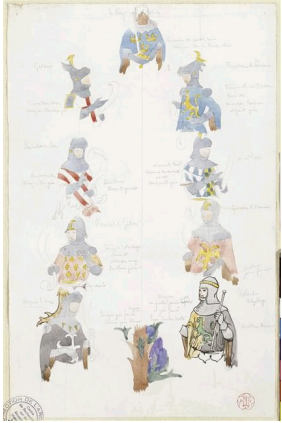
Eugene-Emmanuel Viollet-le-Duc, sketch for the fireplace decoration in the Empress' room at the Chateau of Pierrefonds, circa 1857, Library of the Architecture and Patrimony, Charenton-le-Pont.