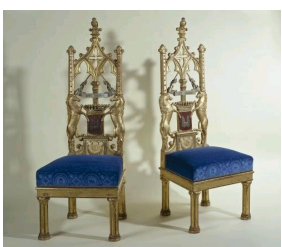
François-Honore Jacob-Desmaltre, chairs from the Countess of Osmond's Gothic cabinet, 1817-1820, Paris, Petit Palais.

The great vogue for the Middle Ages and the Renaissance was already evident at the end of the eighteenth century, and reached the masses at the beginning of the 19th century, invading the decorative arts : not only the fine arts but all kinds of objects were decorated with knights' helmets, crenelated towers and pretty damsels. The fireplace area is not in left out, enabling the manufacturing of picturesque hoods and monumental overmantel, painted in the manner of the great seigniorial rooms. Hence, Viollet-le-Duc imagined a fireplace decorated with knights for the Empress's room at the Chateau of Pierrefonds , about 1857.