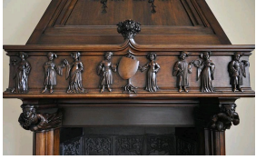
Monumental fireplace with Troubadour scenes decoration, 19th century, Marc Maison Gallery.