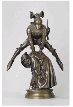
Gustave Dore, Fun, 1881, Paris, Orsay Museum.