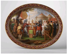
Plate of the Duguesclin set, 1835, painting after Alexandre-Evariste Fragonard, Sevres, Cité de la céramique.