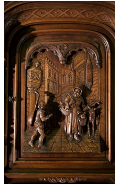
Troubadour scene carved on a Neo-Renaissance dresser, circa 1880, Marc Maison Gallery.