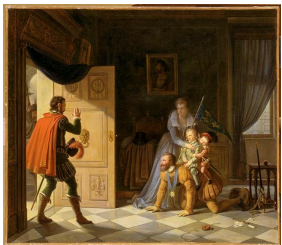
Pierre Revoil, Henri IV playing with his children, 1817, National museum of the Chateau of Pau.