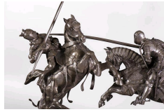
Count de Nieuwerkerke, The Death of the Duke of Clarence, 1838, Marc Maisson Gallery.