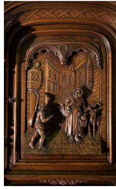
Troubadour scene carved on a Neo-Renaissance dresser, circa 1880, Marc Maisson Gallery.