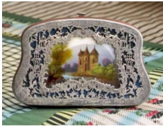
Purse, circa 1852-1870, Galliera Palace, the City of Paris' museum of Fashion.