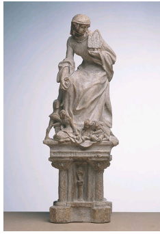
Félicie de Fauveau, Model for a monument to Clemence Isaure, 1845, Museum of the Augustinians, Toulouse.