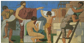
Detail of the monumental door, Architecture