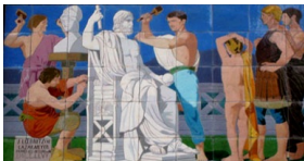
Detail of the monumental door, Sculpture