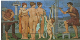
Detail of the monumental door, Painting