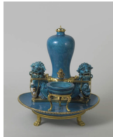
Picture 8 : Perfume fountain, Blue Chinese Kang Hsi porcelain, gilt bronze, Paris, circa 1780. Former collection of Marie-Antoinette.