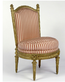
Picture 15 : Marie Antoinette side chair, by Jacques Gondoin, 1780-1781. Part of a suite of eight side chairs which stood in the salon du rocher of the Belvedere Pavilion located in the gardens of the palace of Versailles.