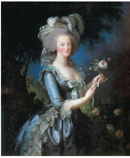
Picture 1 : Portrait of Marie-Antoinette by Louise Elisabeth Vigée Le Brun, 1783.