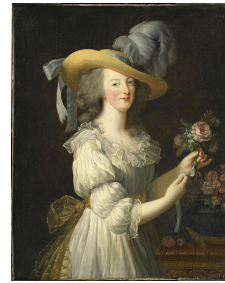
Picture 10 : Portrait of Marie-Antoinette wearing a « gaule », Elisabeth Vigée Le Brun, 1783.