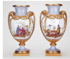
Picture 9 : Vase Duplessis with Chinese scenes, Sèvres Manufactory. Bought by Queen Marie-Antoinette, December 1779 for 2400 livres. Purchased by George IV in 1817.