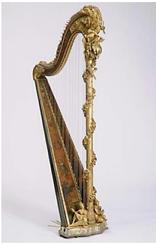
Picture 6 : The harp of Marie Antoinette, 1774.