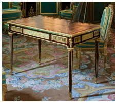
Picture 7 : Desk, Jean-Henri Riesener, built in oak, amaranth, stained sycamore, gilt bronze and leather, Paris, 1785-88. © Palace of Versailles, Cabinet Doré.