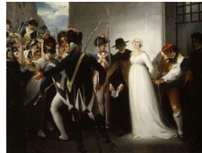
Picture 14 : William Hamilton, Marie-Antoinette taken to her execution, oil on canvas, 1794.