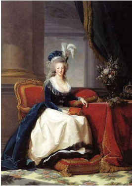
Picture 2 : Portrait of Marie Antoinette, 1783, by Louise Elisabeth Vigée Le Brun.