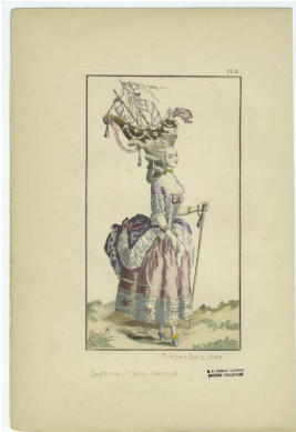
Picture 3 : «A la Belle Poule », hairstyle created by Leonard, Marie-Antoinette's hairdresser, to celebrate the victory over a frigate of the same name which belonged to the English on the 17th of June 1778.