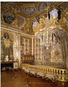
Picture 4 : The Queen's bedroom, as it was during the last summer of Marie-Antoinette at the Palace of Versailles.