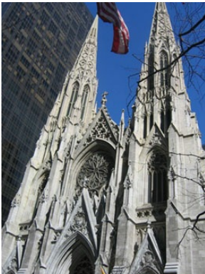
Neo-Gothic facade of Saint-Patrick's Cathedral, New York, 1885-1888, James Renwick Jr.