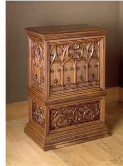
Princess Marie d'Orleans' neo-Gothic living-room at the Tuileries, by Prosper Lafaye, 1842, Paris. The painter placed Princess Mary before her gothic lectern, re