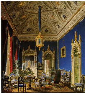
Neo-Gothic style living-room project, watercolour, c.1836. Neo-gothic style permeated everything from furniture, to mirrors, to the mantelpiece...