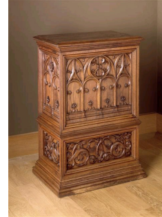
Princess Marie d'Orleans' neo-Gothic living-room at the Tuileries, by Prosper Lafaye, 1842, Paris. The painter placed Princess Mary before her gothic lectern, re