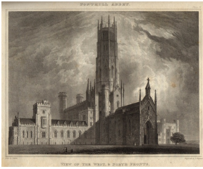
Front of Fonthill Abbey, England.