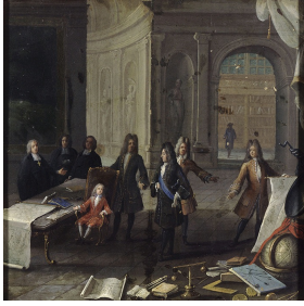
Louis XV taking a lecture, in attendance of the cardinal de Fleury and the Regent, c. 1717, anonymous painting preserved in Carnavalet museum.