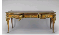
Flat desk by Charles Cressent, c. 1740, Louvre museum, inv. OA5521.