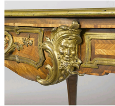
Detail of a bearded head in gilded bronze, ornament by Cressent for his flat desk.