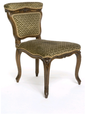
"Ponteuse", by Sulpice Brizard, preserved by the museum of Decorative Arts, Paris, inv. 36123.