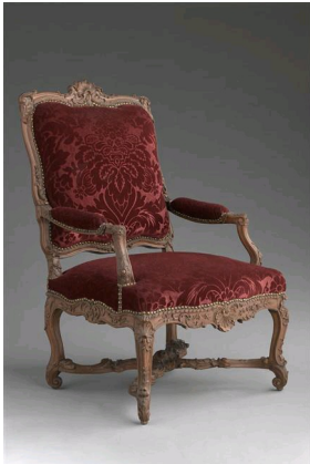
Armchair with flat back ("à la reine"), sculpted beech and walnut, the armrests are stuffed and set back; c. 1720-1730, Louvre museum, inv. OA10502.

In the first decade of 18th century, furniture shapes are bent and the decorative arts soften while the Sun King (Louis XIV) is fading. This transformation of the taste goes on when Louis XIV dies in 1715 and until his heir comes of age in 1723, while the Regency is insured by Duke Philip of Orleans . After the Regency, which is considered as a transitory time for taste, the Louis XV style will be distinguished by its fantasy and asymmetries.