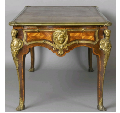
Flat desk by Charles Cressent, side view. One can admire the two "espagnolettes" and the marquetry work.