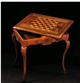
Playing table Régence style, beech, walnut, holly veneer, box tree, amaranth, walnut and bone. Kohn - Paris, auction of November 17th, 2010, Drouot-Richelieu.