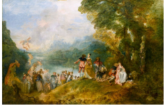
Antoine Watteau, Pilgrimage to the Isle of Cythera, 1717, Louvre museum.