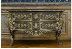
Chest of drawers "tombeau", in veneered ebony and gilded bronze, held in Château de Versailles. It displays two "espagnolettes" at the corners.