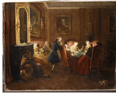
Pierre Louis Dumesnil, Card players, c. 1735, Metropolitan Museum of Art, New York.