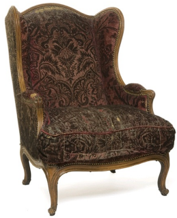
"Bergère" chair with wings, beech, original stuffing. Decorative Arts Museum, inv. 5408 ; ©photo Les Arts Décoratifs.

In 1830, the Rococo style fascinates Théophile Gautier, a major critique, who advocates its fantasy and playfulness. In 19th century , numerous mansions and castles provide themselves with Regence furniture, thanks to 19th century fabrication of furniture and bronzes by Beurdeley and H. Dasson.