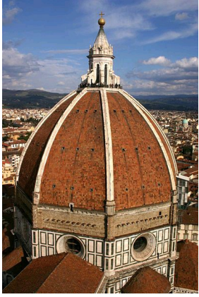
Dome of the Basilica di Santa Maria del Fiore by Brunelleschi.