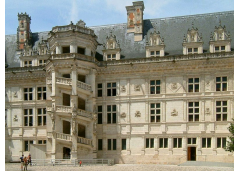
The château of Blois.