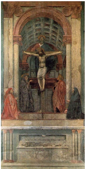
The crucifixion by Masaccio.