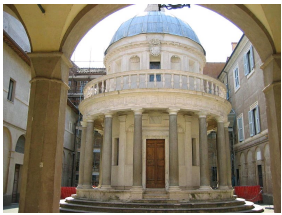
The Tempietto by Bramante in Rome.