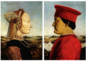
The portraits of the Duke of Urbino and his wife by Piero Della Francesca.