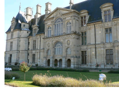
The château of Ecoen.