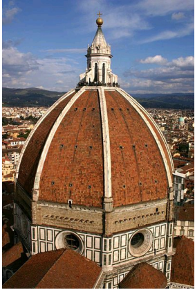
Dome of the Basilica di Santa Maria del Fiore by Brunelleschi.