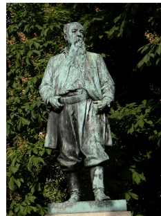
Monument to Hans Canon, Stadtpark, 1905.