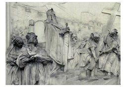
Bas-relief depicting the legend of the founding of the St. Peter's Church of Vienna by Charlemagne, 1906.