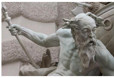
Detail of Power On The Sea.