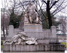
The Johannes Brahms Monument on Karlsplatz, 1908, by Rudolf Weyr.