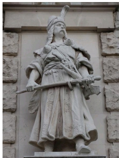
Magyar of the Neue Burg front, 1895-1901.