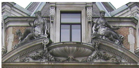
Villa Hermes tympanums, 1884.