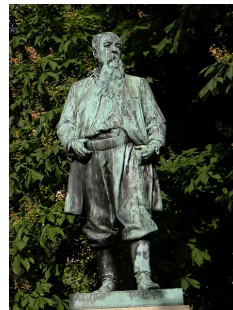
Monument to Hans Canon, Stadtpark, 1905.