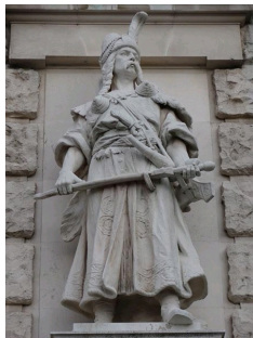
Magyar of the Neue Burg front, 1895-1901.