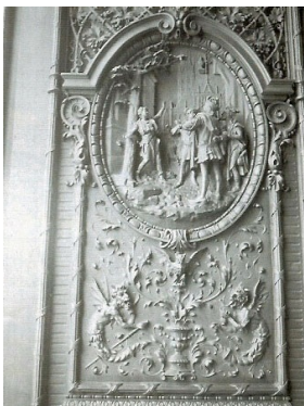
Bronze door bas-relief of Equitable Palais, 1890-1891.