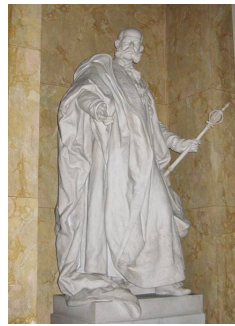
Statue of the Emperor Franz Joseph I in Schwechat, 1898.