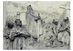
Bas-relief depicting the legend of the founding of the St. Peter's Church of Vienna by Charlemagne, 1906.