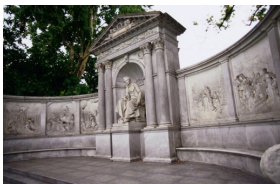
Grillparzer Monument, 1889.