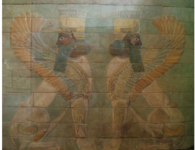
Decorative panel with symmetrical winged male sphinxes from the palace of Darius I at Susa, 522-486 BC, Louvre Museum, Paris.