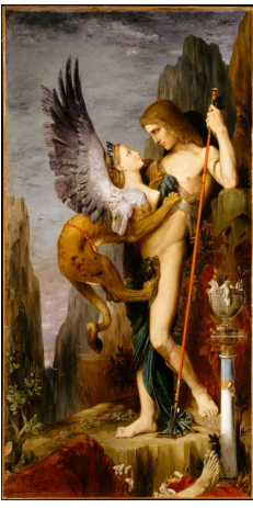
Oedipus and the Sphinx, Gustave Moreau, 1864, oil on canvas, Metropolitan Museum of Art, New York City.