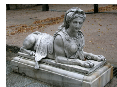
Sphinx, mid-18th century, La Granja, Spain. At the end of the 17th century, the sphinx became a common figure in European gardens.