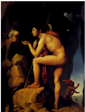
Oedipus and the Sphinx, Ingres, 1808-1827, oil on canvas, Louvre Museum, Paris.

The sphinx is a mythological creature that most often has a human bust and a lion's body , but sometimes a bull's or a horse's instead. This mythological creature can be represented with wings , a bull's horns , or a snake tail. It appeared in Egypt during the 3rd millennium BC, and then in the Ancient Near-East.