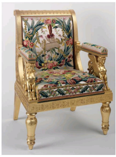
Armchair with Sphinx coming from the Queen bedroom, Chateau of Fontainebleau. 19Th century.