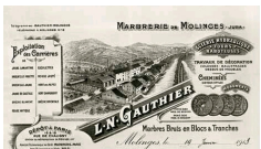
Company of Molinges marble works, old advertising.