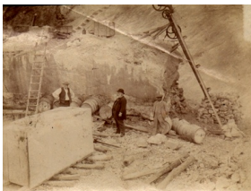
A quarry in Pratz in the early 20th century.