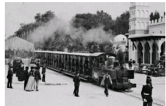
Decauville railroad train at the Exhibition, Library of Congress, Washington.