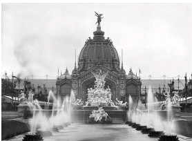
Adolphe Giraudon, Central dome of the exhibition and luminous fountain by Coutan, 1889.