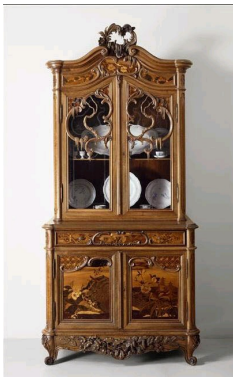
Emile Gallé, Winter Flora Cabinet, Orsay Museum, Paris.