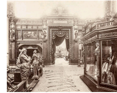
Photograph of the Furniture Gallery, 1889.