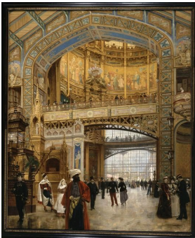
Louis Berroud, Central dome of the 1889 World's Fair, 1890, Carnavalet Museum, Paris.