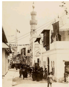
Cairo Street of the World's Fair of 1889.

The clockmaker's section at the World's Fair of 1889.