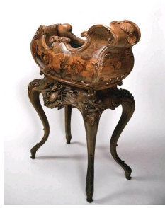
Emile Gallé, Flora planter, Museum of the École de Nancy, Nancy.