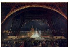
G. Roux, Night festivities of the

Like the World's Fair of 1876 in Philadelphia , the exhibition of 1889 in Paris celebrates a centenary, that of the French Revolution . It is directed by Jean-Charles Alphand, engineer in the city of Paris and close collaborator of Baron Haussmann . The exhibitions of the French colonies and the Ministry of War are held on the Esplanade des Invalides , while Art and Industry are presented on the Champs de Mars and at the Palais du Trocadéro .