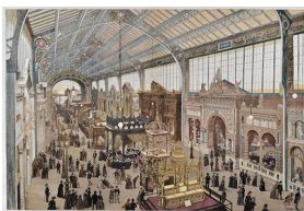
The Gallery of Industries, Carnavalet Museum, Paris.