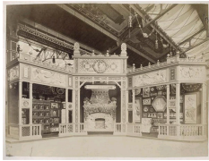
Loebnitz Exhibition, photo by Louis Emile Durandelle, Orsay Museum, Paris.