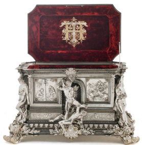
Guillemin Diomède, Box « Seven deadly sins », circa 1885, Museum of Decorative Arts, Paris.