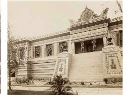
Photograph of the Mexican Pavilion, 1889.