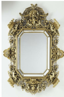
Barbedienne, Sévin, sculptures by Carrier-Belleuse, Monumental mirror, 1867, cast in 1878, Orsay Museum, Paris.