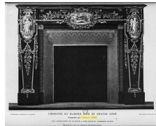
Barbedienne et Sévin, Napoleon III style fireplace, illustration de la Revue des arts décoratifs, 1888.