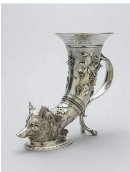
Barbedienne, Sévin and Attarge, Fox-headed Rhyton, design of 1862, Orsay Museum, Paris.

Son of traveling artists, Louis-Constant Sévin (1821-1888) became, in the second half of the 19th century, an eminent and central ornamentalist for the decorative arts. Inseparable from the Maison Barbedienne , he however provided models to many companies for all types of objects: goldsmithing, cabinetmaking, mirrors, boxes, lamps, fireplaces, vases and clocks.