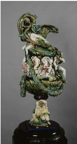
Constant Sévin, Monumental ewer in porcelain, circa 1855, Limoges, national museum Adrien Dubouché.