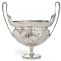
Barbedienne, Sévin, Attarge, Cup, 1863, presented at the World's Fair of 1889, Museum of Decorative Arts, Paris.