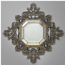
Ornamental Mirror, design by Sévin, enamels by Alfred Gobert, chiseling by Attarge, cast by Barbedienne, World's Fair of 1867, Orsay Museum, Paris.