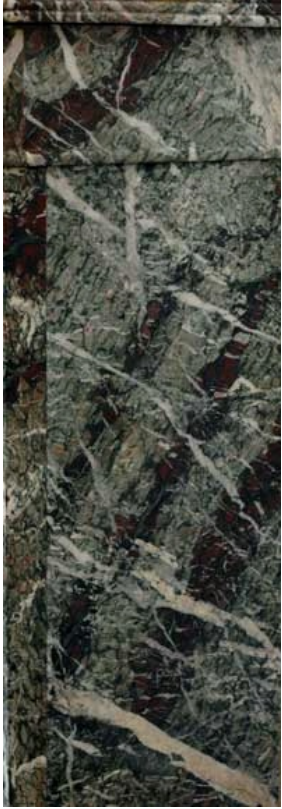
Detail of Campan Petit Mélange