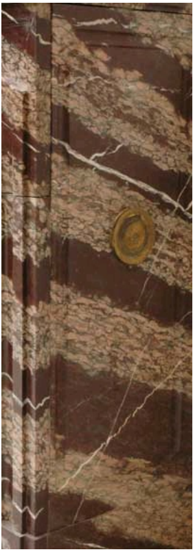
Detail of Campan Rubané