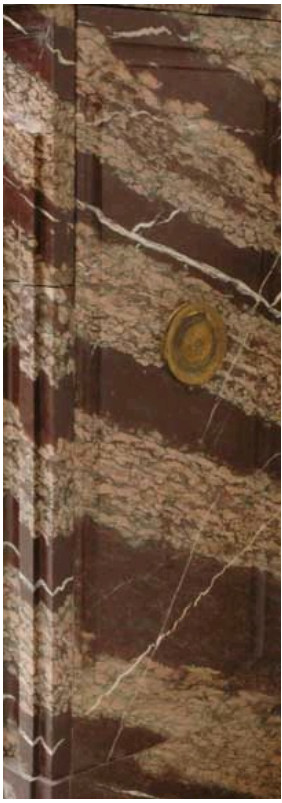
Detail of Campan Rubané