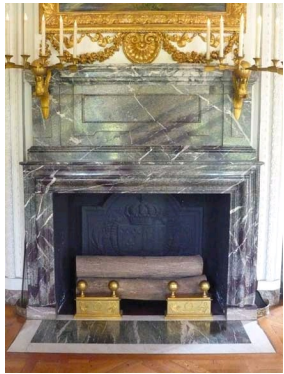
Mantel of the Salon Frais of the Trianon of Versailles, Campan Grand Mélange