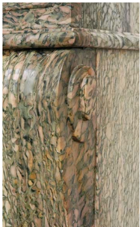
Detail of pink and green Campan

Since Antiquity the quarries of the area of Campan in the High Pyrenees in France have produced a variety of marbles, the most famous of hard stones being, Ribbon Campan marble, Green Campan, the Campan Grand Mélange and not forgetting the Cherry Red variety called Rouge Griotte. All campan marbles are characterized by deep and clearly marked green veins. They were used extensively in the apartments in Versailles under the reign of Louis XIV for fireplaces, but also wall panels because of the beauty of the motifs in the stone. The main decoration of the walls of the Escalier de la Reine in Versailles (the Queen's stairs) features Campan Vert and Campan grand Mélange.