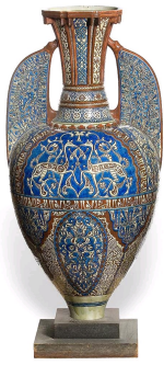
Théodore Deck (1823-1891), « Alhambra » Vase, ca. 1878, earthenware, Les Arts Décoratifs, Paris.