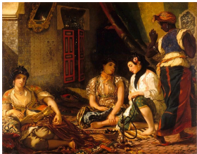
Delacroix (1798-1863), Women of Algiers in their Apartment, 1834, oil on canvas, Musée du Louvre, Paris.