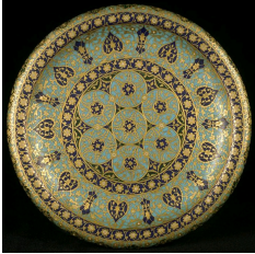
Maison Barbedienne, Ornamental plate with Persian decor, between 1870 and 1880, cloisonné enamel on copper, Musée d'Orsay, Paris