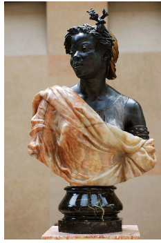
Charles Cordier (1827-1905), Capresse, 1861, bronze and onyx, Musée d'Orsay, Paris.