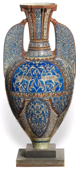
Théodore Deck (1823-1891), « Alhambra » Vase, ca. 1878, earthenware, Les Arts Décoratifs, Paris.