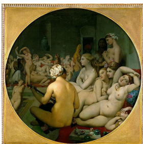
Ingres (1870-1867), The Turkish Bath, 1862, oil on wood, Musée du Louvre, Paris.