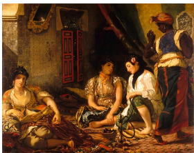
Delacroix (1798-1863), Women of Algiers in their Apartment, 1834, oil on canvas, Musée du Louvre, Paris.