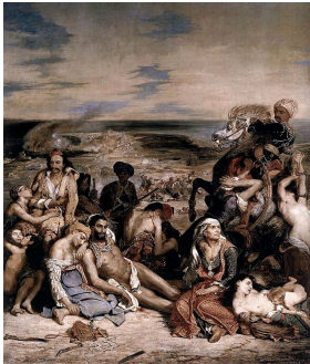
Eugène Delacroix (1798-1863), The Massacre at Chios, 1824, oil on canvas, Musée du Louvre, Paris.