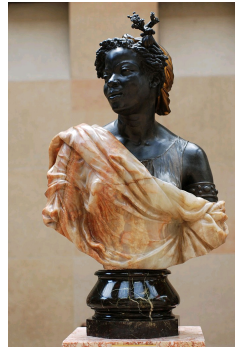
Charles Cordier (1827-1905), Capresse, 1861, bronze and onyx, Musée d'Orsay, Paris.