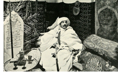
The writer Pierre Loti (1850-1923)