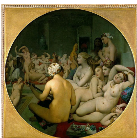
Ingres (1870-1867), The Turkish Bath, 1862, oil on wood, Musée du Louvre, Paris.