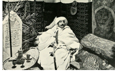
The writer Pierre Loti (1850-1923)