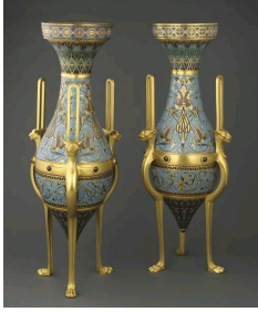
Maison Barbedienne, Constant Sévin, Pair of ornamental vases, copper, gilt bronze and champlevé enamel, Musée d'Orsay, Paris.