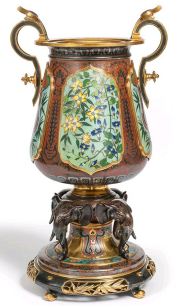
Christoffe & Cie. « Elephant » Vase, ca. 1878, Patinated and inlaid bronze, cloisonné enamel, Les Arts Décoratifs, Paris.