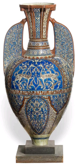
Théodore Deck (1823-1891), « Alhambra » Vase, ca. 1878, earthenware, Les Arts Décoratifs, Paris.