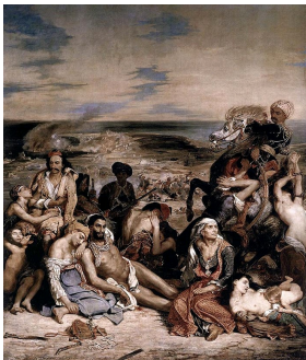
Eugène Delacroix (1798-1863), The Massacre at Chios, 1824, oil on canvas, Musée du Louvre, Paris.