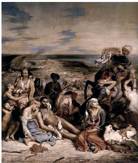
Eugène Delacroix (1798-1863), The Massacre at Chios, 1824, oil on canvas, Musée du Louvre, Paris.