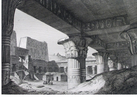
Vivan Denon (1747-1825), Interior of the Temple of Apollinopolis in Eftou, drawing by Denon, engraving by Baltard, Travels in Upper and Lower Egypt, pl.57, 1802.

The Westerners interest for Orient, known as Orientalism , have its roots during the 17th century, but is on the increase during the 19th century thanks to the transport development among other things. Orientalism soon inspires all forms of art and attracts artists belonging to very different currents as it answers to several aspirations. If the movement knows a big fortune in Art , it is primarily related to political events. Napoleonic conquests, first, give the new vision of an Orient as source of a certain knowledge. Artists, like Vivan Denon , accompany expeditions and bring back studies and notebooks with new motifs. A wave of Egyptomania arises from these conquests and imprints the Empire style.