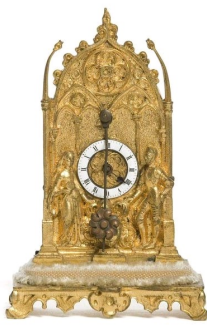
Troubadour Clock, 1835-1850, Museum of Decorative Arts, Paris.