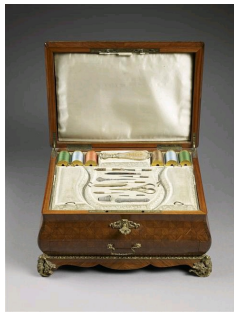
Sewing kit, Compiègne Palace.