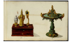
Project of toy and fountain, Giroux Album, Museum of Decorative Arts, Paris.