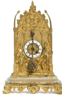
Troubadour Clock, 1835-1850, Museum of Decorative Arts, Paris.