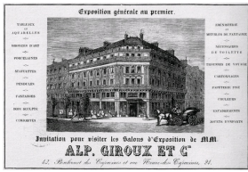
Invitation of Alphonse Giroux and Co, 1857-1867.