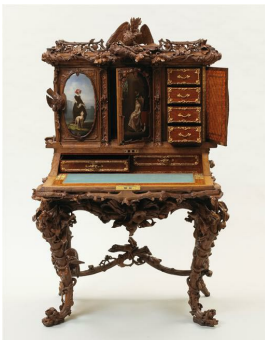
Cabinet of Empress Eugénie made by Alphonse Giroux, presented at the 1855 World's Fair, Compiègne Palace.