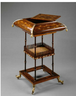
« Working » table by Alphonse Giroux, circa 1835, Louvre Museum, Paris.

Alphonse Giroux , " the merchant of the princes ", is an important Parisian manufacturer of luxury furniture and accessories, whose products were intended for an aristocratic and bourgeois clientele, installed as early as 1799 at No. 7, rue du Coq Saint -Honoré, then Boulevard des Capucines. Founded by François-Simon-Alphonse Giroux under the name " A. GIROUX in PARIS ", it was taken over by the Giroux children and remained active under the name of " Alphonse Giroux et Cie " until 1867, when the direction is taken over by Ferdinand Duvinage .