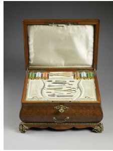
Sewing kit, Compiègne Palace.