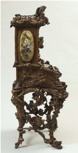
Cabinet of Empress Eugénie, presented at the 1855 World's Fair, Compiègne Palace.