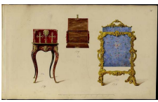
Mounted box and firescreen, Giroux Album, Museum of Decorative Arts, Paris.