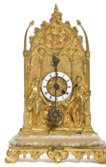
Troubadour Clock, 1835-1850, Museum of Decorative Arts, Paris.