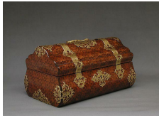
Box, circa 1860, Metropolitan Museum of Arts, New York.