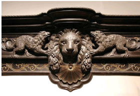
Detail of a Belgium Black marble fireplace from the 19th century. Exceptional craftsmanship in the sculpting work of the lion head and the fox cubs that emerge

In the 19th century , these fine and deep black marbles, were used in the production of fireplaces and clocks. In this category, the Mazy Black and Dinant Black marbles were most commonly used. Unfortunately it is very difficult, without the help of a scientific analysis, to know from which quarries this marbles comes. Generally, the Dinant Black used for the production of clocks or manufacture of fine sculptures. Meanwhile, Mazy Black was used for fireplaces tiles, baseboards, shelves, vertical coverings, steps, fine sculptures and mantels .