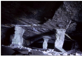
Saint Anne quarry, close to Dinant in Wallonia, Belgium. The walls have been cut with a longwall mining.

Black marbles grouped under the name Belgium Black marbles refers to several types of black marbles, such as the Black Mazy , the Black Dinant , Black Theux marble or the Black Golzinne .