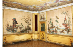
The Palazzo Papadopoli's Chinese Room, decoration by Michelangelo Guggenheim. Neo-Rococo Style, inspired by 18th century "chinoiserie".