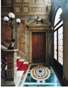
The grand staircase in Palazzo Papadopoli, by Michelangelo Guggenheim. Neo-Renaissance Style, inspired from the Florentine 15th century.