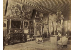
Permanent exhibition of the Stabilimento d'arti decorative e industriali in Palais Balbi. Guggenheim furniture, ancient paintings and antiquities.