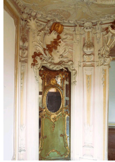
Door in the Palazzo Papadopoli's Stucco Room, decoration by Michelangelo Guggenheim. Neo-Rococo Style, inspired by Louis XV Style.