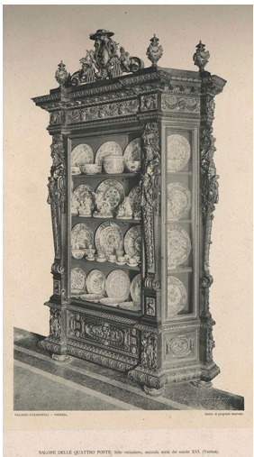
Dresser designed and produced by Guggenheim for the Salone delle Quattro Porte in the Palazzo Papadopoli. Neo-Renaissance Style, inspired by the second half of Venetian 16th century.