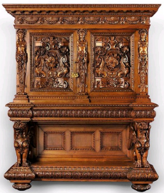
Credenza by Guggenheim from the Salone delle Quattro Porte in the Palazzo Papadopoli. Neo-Renaissance Style, walnut, Marc Maison Gallery.