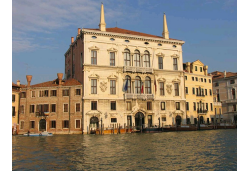
The Balbi Palace, on the Grand Canal, Venice.