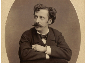
Portrait of Moise Michelangelo Guggenheim

In Venice at the end of the 19th century, Moses Michelangelo Guggenheim was a well-known figure: antiquarian, collector, maker of artistic furniture and active participant in the public life of the city. Present in committees of numerous exhibitions, he was named Academic of merit by the Royal Academy of Beaux-Arts, corresponding with the University of Venice, Commander of the Crown of Italy and Knight of the order of the saints Maurice and Lazare. He occupied a particularly important place as a protagonist of the debate on the reorganization of the Correr Museum, around the years 1880 -1890.