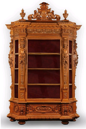
Dresser by Guggenheim from the Salone delle Quattro Porte in the Palazzo Papadopoli. Neo-Renaissance Style, walnut, Marc Maison Gallery.