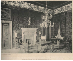
Photograph of the Salone delle Quattro Porte decorated and furnished by Guggenheim in the Palazzo Papadopoli. Neo-Renaissance Style, inspired from the Venetian 16th century.