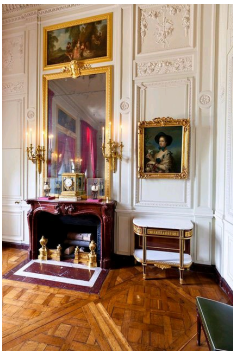
The Queen's Bathroom in Petit Trianon, Palace of Versailles.