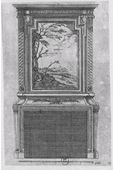
Louis XIV style sculpted overmantel and overmantel mirror, in the Fireplace book by Jean Marot, 1660.