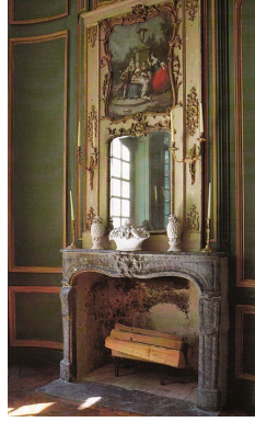
Castle of Morsan, Louis XV style overmantel with a mirror and a genre painting.