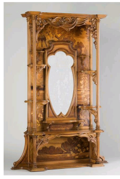
Émile Gallé, Overmantel with mirror, Orsay museum, inv. OAO1468