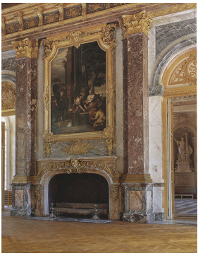
The Hercules Salon, Palace of Versailles, 1729-1736.