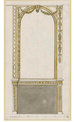
Charles de La Fosse, project of an overmantel, 1780, Louvre museum, inv. 3726DR.