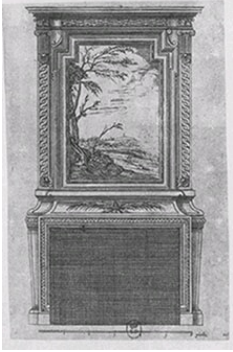
Louis XIV style sculpted overmantel and overmantel mirror, in the Fireplace book by Jean Marot, 1660.