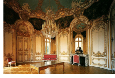
The Princess of Rohan's room, Hôtel de Soubise in Paris, designed by Germain Boffrand, 1732.