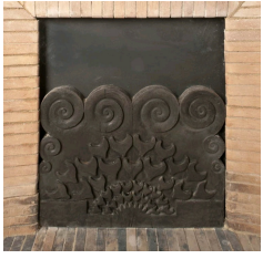
Picture #6 : Art Deco cast iron fireback from Jeanne Lanvin's bedroom, (16 rue Barbet de Jouy à Paris, demolished in 1965).