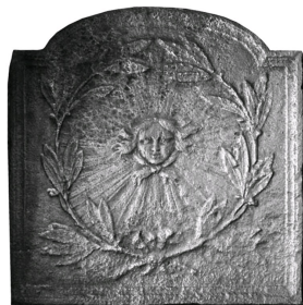
Picture #3 : Louis XIV style cast iron fireback. The Sun King with a laurel wreath.