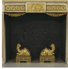
Picture #8 : Mythological fireback and camels andirons in Marie Antoinette's Turkish boudoir.