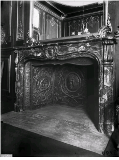
Picture #7 : Eugène ATGET (1857-1927), Fireplace from the Choiseul-Praslin Hôtel in Paris, picture taken in 1912. Complete hearth in cast iron with the fireback.