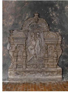
Picture #9 : Renaissance fireback displaying a mythological scene figuring Mars and Venus, c.1580.