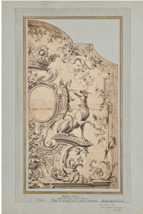
Picture #2 : Louis Fordrin, cast iron fireback project.