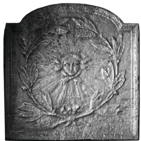
Picture #3 : Louis XIV style cast iron fireback. The Sun King with a laurel wreath.

The Art Nouveau and Art Deco periods proved to be successful for highly technical ironwork with great artists such as Edgar Brandt (1880-1960) and Raymond Subes (1891-1970) . A new production of fireplace firebacks began. However, after the Second World War, along with the generalization of modern heating methods, fireback production strongly decreased.