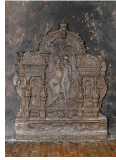
Picture #9 : Renaissance fireback displaying a mythological scene figuring Mars and Venus, c.1580.