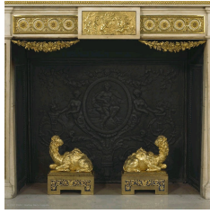
Picture #8 : Mythological fireback and camels andirons in Marie Antoinette's Turkish boudoir.