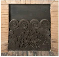
Picture #6 : Art Deco cast iron fireback from Jeanne Lanvin's bedroom, (16 rue Barbet de Jouy à Paris, demolished in 1965).