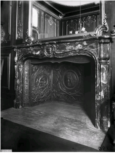
Picture #7 : Eugène ATGET (1857-1927), Fireplace from the Choiseul-Praslin Hôtel in Paris, picture taken in 1912. Complete hearth in cast iron with the fireback.