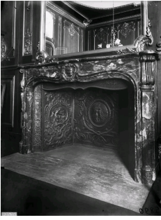
Picture #7 : Eugène ATGET (1857-1927), Fireplace from the Choiseul-Praslin Hôtel in Paris, picture taken in 1912. Complete hearth in cast iron with the fireback.