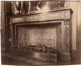
Picture #1 : Eugène ATGET (1857-1927), Egyptian room fireplace mantel with its complete hearth in cast iron, Louvre Museum. The fireback is only the plate in the back.