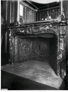
Picture #7 : Eugène ATGET (1857-1927), Fireplace from the Choiseul-Praslin Hôtel in Paris, picture taken in 1912. Complete hearth in cast iron with the fireback.