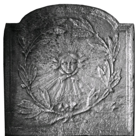
Picture #3 : Louis XIV style cast iron fireback. The Sun King with a laurel wreath.