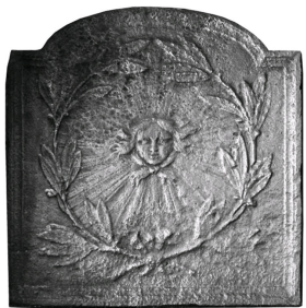
Picture #3 : Louis XIV style cast iron fireback. The Sun King with a laurel wreath.