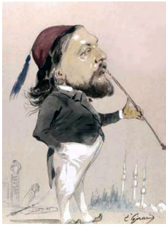
Eugène Giraud, Théophile Gautier Smoking His Chibouk, 1862, watercolor, BnF, Paris.