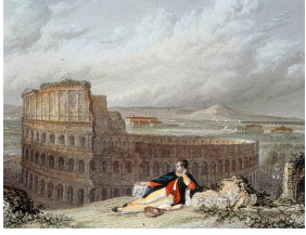
Arthur or James Tibbets WILLMORE, Lord George BYRON contemplating the Colosseum in Rome, Bibliotheque des Arts Decoratifs, Paris, France.