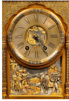
Escalier de Cristal (Att. to), Hunt Scenes Bronze mantle garniture in the Indian style patinated in three colors (Ref #03208).