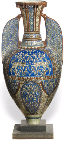
Théodore Deck (1823 - 1891), Alhambra vase, 1878, Decorative arts Museum, Paris.