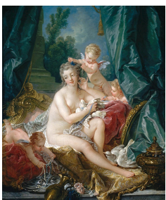
Picture n°6 : François Boucher (1703-1770), The Toilette of Venus,