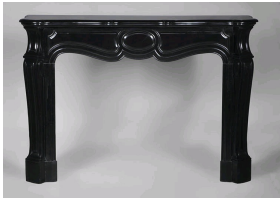
Picture n°3 : Large antique Pompadour Louis XV style fireplace made out of Black from Belgium marble.