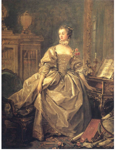
Picture n°12 : François Boucher (1703-1770), Madame de Pompadour, the hand on a harpsichord keyboard, about 1750, Louvre, Paris. Surrounded by Louis XV style works of art, the Marquise appears as an ambadress of the arts.

1751, Met, Nw York. This oil on canvas was commissioned for the dressing room at Bellevue, gift of Louis X to his mistress. Even if this is not a portrait, this is an allusion to the beauty of the Marquise de Pompadour.