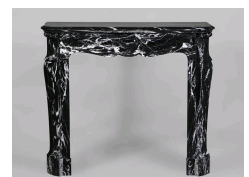
Picture n°11 : Small antique Pompadour Louis XV style fireplace in Black Marquina marble.