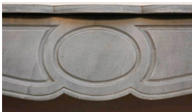
Picture n°5 : Simple Pompadour grey fireplace mantel - detail of the characteristic carved with oblong mouldings on either side of a circular motif.