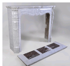
Picture n°8 : Antique Louis XV style fireplace in white veined marble, close to the Pompadour model.