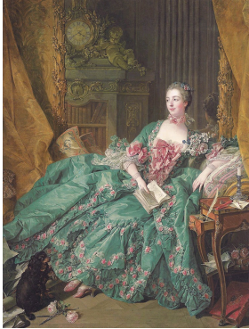
Picture n°2 : François Boucher (1703-1770), marquise de Pompadour portrait, 1756, Munich, Alte Pinakothek.