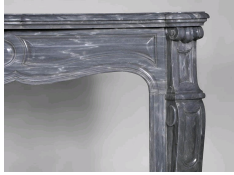
Picture n°13 : Antique Louis XV style fireplace, Pompadour model, made out of Blue Turquin marble - detail of the right corner.

white veins 19th century fireplace mantel - copper vent detail.