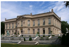
Picture n°3 : The Elms, Edward and Sarah Berwind's Summer residence in Newport Beach, Rhode Island.

The private areas—the owners' rooms and a remarkable Onyx and alabaster bathroom—are found on the third floor.