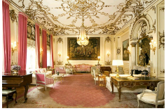
Picture n°6 : The Gold Ballroom on the second floor, next to the Louis XV hall.