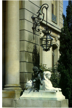
Picture n°14 : Entrance to The Elms with a lantern on a bracket and sculptures of a sphinx and a putto.