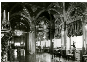
Picture n°5 : Photograph of the same Louis XV hall in 1980. The fireplace can be seen on the left-hand side of the picture.

The bathroom is in a Louis XVI style, but very modern, because it is equipped with electricity and corresponds to