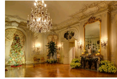
Picture n°16 : Ballroom at The Elms today, with Christmas decorations.