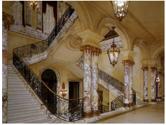
Picture n°12 : The grand stairway designed by Jules Allard for The Elms.