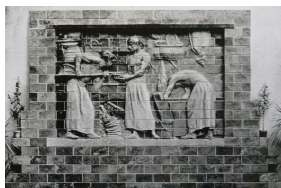
Old photo of low relief feature “the bakers” by Alexander Charpentier.