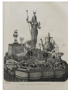
Exhibition of the goldsmith Baugrand, "The Wonders of the World's Fair", press illustration, 1867, RMN.