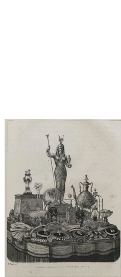
Exhibition of the goldsmith Baugrand, "The Wonders of the World's Fair", press illustration, 1867.

The World's Fair of 1867 took place during a period of social and labour struggle. Taking place during a period of contestation in the working world, this exhibition is considered preponderant for three reasons. Firstly it is considered a great retrospective of the history of work. Secondly it was an exhibition that featured products hoping to improve both the physical and moral conditions of the population at the time. Finally it was an exhibition that saw the arrival of labour delegations at the expense of the state. These connections were incorporated in the founding texts of the French trade unionism, and some were enforced in legislation. In a sort of utopia, the state attempted to portray the Universal Exhibition as guarantor of the worker's well-being in social harmony. The nationalist hyperbole of the preceding Universal Exhibitions thus replaced the worry of dispute among the workforce. This reversal of values was a means of appeasing the anger and revolt deep within, which unfolded, the year after, in the Revolution of 1868 .