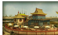
China's Pavilion, reconstitution.