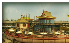
China's Pavilion, reconstitution.