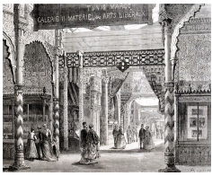
Pavilion of Tunisia and Morocco.