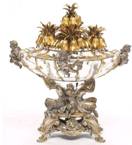
Froment-Meurice, François Carlier, Cup of the table center piece ordered by Napoleon III, 1867, Museum of Decorative Arts, Paris.