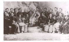
The Japanese delegation around Tokugawa-Akitake, illustration from the Monde Illustré, 1867.