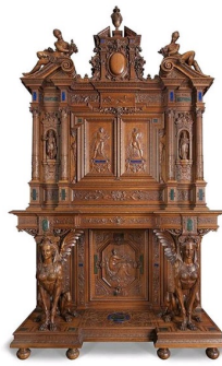
Henri-Auguste Fourdinois, Two story Cabinet, Grand Prix of the World's Fair of 1867, Museum of Decorative Arts, Paris.