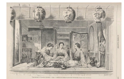
Interior of Governor Satzouma's house, illustration from the Monde Illustré, 1867.