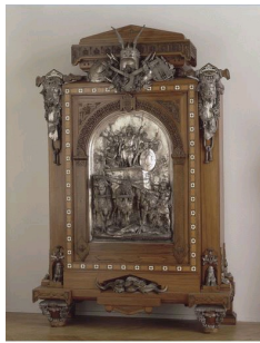
Charles Guillaume Diehl, Jean Brandely, Emmanuel Fremiet, Medal Cabinet, 1867, Orsay Museum, Paris.