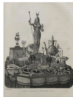
Exhibition of the goldsmith Baugrand, "The Wonders of the World's Fair", press illustration, 1867.