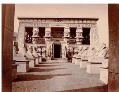
Athor Temple, photo by Pierre Petit, National Archives.

Achieving even more wonders than the previous ones, the World's Fair of 1867 , organized by Napoleon III in Paris , is one of the most important World's Fairs. To bring together 32 countries and their colonies, Napoleon III innovates to "make it more universal than the previous ones" , notably by organizing it with national Pavilions, which will remain the formula of the future exhibitions.