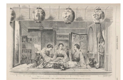
Interior of Governor Satzouma's house, illustration from the Monde Illustré, 1867.