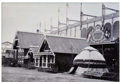
Russian Isbas in the Exhibition's park, photograph from 1867.