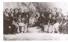
The Japanese delegation around Tokugawa-Akitake, illustration from the Monde Illustré, 1867.