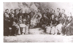
The Japanese delegation around Tokugawa-Akitake, illustration from the Monde Illustré, 1867.