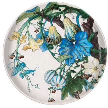
Théodore Deck and Eléonore Escallier, 1867, Museum of Decorative Arts, Paris.