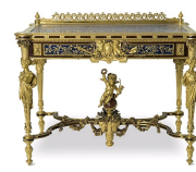
Christofle et Cie, sculptures by Carrier-Belleuse and Joseph Cheret, Toilet Table of Gustave Pereire, 1867, Museum of Decorative Arts, Paris.