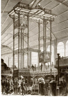
The hydraulic lift of Leon Edoux.