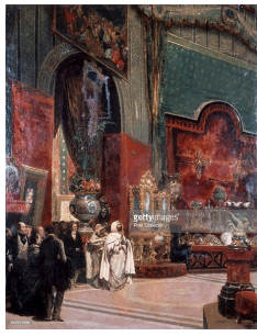
Prosper Lafaye, Abd-el-Kader visits the Paris Universal Exhibition, 1855, Getty Image.