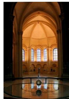
Foucault pendulum, presented at the 1855 World's Fair, Paris, Musée des arts et métiers.