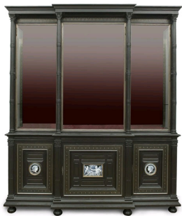
Cabinet by Fourdinois in enamelled ebony, Great Medal of Honor of the 1855 Exhibition, Paris, Museum of Decorative Arts.