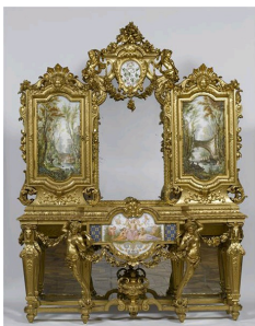
Jules Fossey, Jewel cabinet acquired by Empress Eugenie at the 1855 World's Fair, Compiègne Palace.