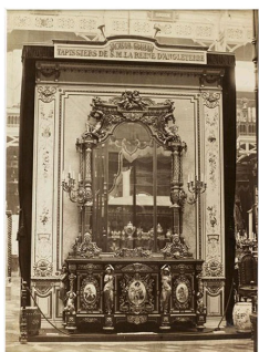
Cabinet by Jackson & Graham, Compiègne Palace.