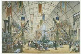
Max Berthelin, An inside view of the Gallery of Machines at the 1855 World's Fair, Paris, Carnavalet Museum.