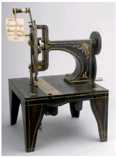
Sewing machine by Isaac Singer, patented model from 1851 and presented at the 1855 World's Fair. National Museum of American History, Washington.