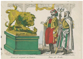
Detail of the print « A Walk at the Paris 1855 World's Fair », Pellerin, 1855, National Library of France.

In 1855 , the second World's Fair opened in Paris ; Response to the British challenge of the World's Fair of 1851 . Presented as the "Exhibition of Agricultural, Industrial and Fine Arts Products" , it focuses on fine arts and agriculture, enabling to enhance the many French artists and the wealth of local products, including wine. For Napoleon III , it is a matter of affirming the existence of the Second Empire , a young regime faced with European and multi-decadal powers.