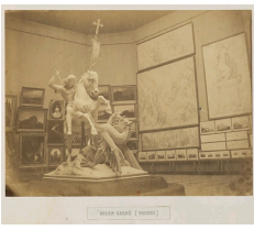
Andre Disderi, The Fine Arts Pavilion at the 1855 World's Fair, Compiègne Palace.