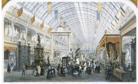
Provost, A view of the Palais de l'Industrie's grand nave, 1855, Saint-Gobain's Archives, Paris, Orsay Museum.