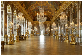
The hall of Mirrors in Versailles Palace