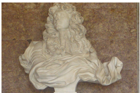
Bust of Louis XIV by Le Bernin