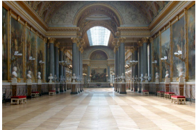
The Battles Gallery in Versailles Palace

Classified as a historical monument and inscribed on the list of World Heritage, the Versailles palace is considered one of the major works of the 17th century. It is considered a national symbol referring to a prosperous past and a French way of living.