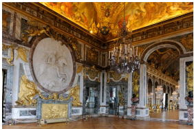
The War salon in Versailles Palace