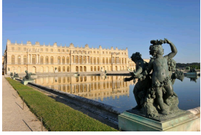
View of Versailles Palace from water feature

Fantatised home of the French kings, symbol of monarchic power, the Versailles palace still incites enthusiasm and passion today. Important feature of the Versailles property: it sits on 63.154m 2 with 2,300 rooms.