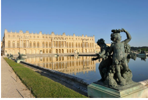
View of Versailles Palace from water feature

Fantasised home of the French kings, symbol of monarchic power, the Versailles palace still incites enthusiasm and passion today. Important feature of the Versailles property: it sits on 63.154m 2 with 2,300 rooms. Originally, a modest hunting castle, named “ weak castle of Versailles ”, it was constructed by Louis XIII in 1623 and then extended in 1631. In 1669, his son, Louis XIV undertook a great project hoping to change the castle into a royal residence. It was then that successive extensions were undertaken by architecture Louis Le Vau and then Jules Hardouin-Mansart , under the unifying hands of Charles Le Brun . Perceived as a symbol of economic and artistic power of France, it was both the seat of power and absolute monarchy, envied and copied by most European courts. The court and the government thus installed itself at Versailles Palace from 1682, under the order of Louis XIV , and remained there until the Revolution.