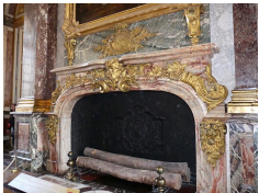
Fireplace from the Salon of Hercules by Antoine Vassé.