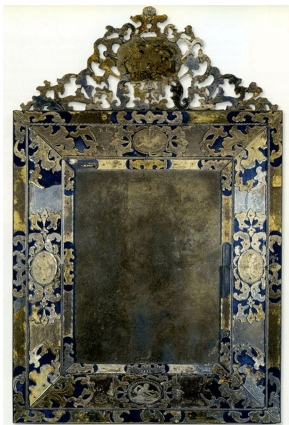
Venetian mirror maker, Mercury mirror with a glass framing, late 17th - early 18th century.