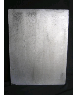
Mercury mirror's back.