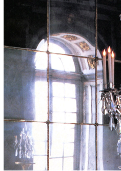
Hall of Mirrors (tinning detail), Versailles Palace.