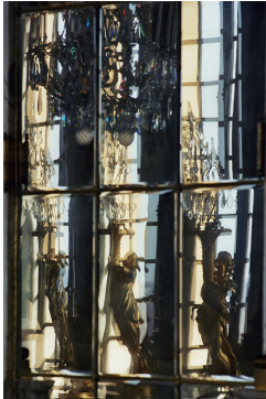
Hall of Mirrors mirrors (beveled mirrors detail), Versailles Palace.