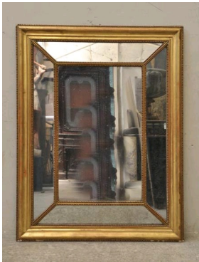
Mercury mirror with a gilded stucco and wood framing.