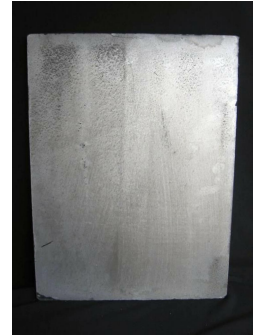
Mercury mirror's back.