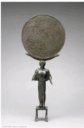
Caryatid mirror made of bronze, 490-480 BC, Provenance: Thebes(?), Aegina style.