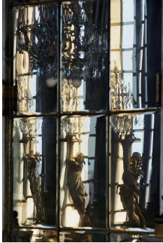
Hall of Mirrors mirrors (beveled mirrors detail), Versailles Palace.