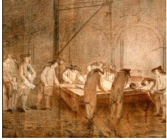
Casting of mercury mirror in Saint-Gobain with Pierre Delaunay-Deslandes, director of the manufacture from 1758 to 1789. Oil on canvas.