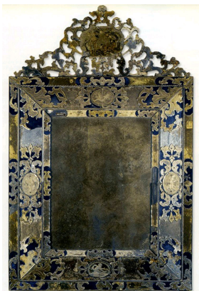
Venetian mirror maker, Mercury mirror with a glass framing, late 17th - early 18th century.