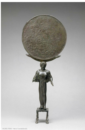
Caryatid mirror made of bronze, 490-480 BC, Provenance: Thebes(?), Aegina style.