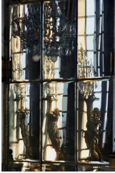
Hall of Mirrors mirrors (beveled mirrors detail), Versailles Palace.