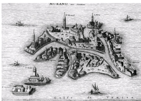
Dancckerts, the city of Venice (detail of the island of Murano), circa 1600, engraving.