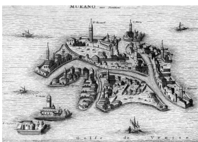
Danckerts, the city of Venice (detail of the island of Murano), circa 1600, engraving.