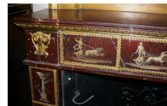
Detail of the fireplace kept at the Louvre museum.