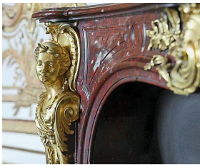
Fireplace kept at the Louvre museum in Paris made out of Griotte red marble and with bronze ornaments.

The Red Griotte marble has also been extracted from other places like Sost, near Mauléon-Barousse, in the quarry of Coumiac in Cessenon-sur-Orb, and in Spain nearby Lezo and Renteria. Broadly exported, the United States have particularly appreciated this noble material's sophistication.