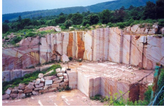
Quarry of Caunes-Minervois, France.