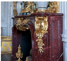
Fireplace of Madame Victoire's Apartments, Palace of Versailles.