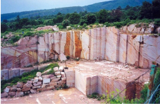
Quarry of Caunes-Minervois, France.