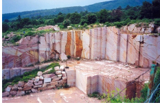
Quarry of Caunes-Minervois, France.