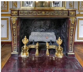
Fireplace of Louis XVI's Wardrobe Cabinet, Palace of Versailles.