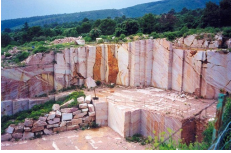
Quarry of Caunes-Minervois, France.