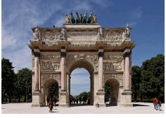
The Carrousel Arch of Triumph, Carrousel place, Paris.

Clock by Balthazard, Chateau of Fontainebleau.