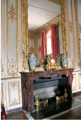
Fireplace in Louis XV's cabinet at Versailles Palace made out of Griotte red marble.

The Griotte red was one of the preferred marbles for royal apartments in 18th century , to make fireplaces in particular. Louis XIV, very fond of this peculiar red, orders the design of a large amount of fireplaces made out of this marble for the Versailles Palace. With no ornaments, only magnified by the marble's color, one can there admire the fireplace of Louis XV's Cabinet . The others are generally ornamented with gilt bronze, like those of the Counsel Cabinet, Louis XVI's Wardrobe Cabinet, the Gilded Study, Madame Victoire's Apartments, Marie-Antoinette's Apartments , etc.