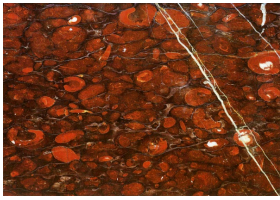
Sample of Red Griotte marble

The Red Griotte marble gets its name from the Morello cherry, " griotte " in french, that has an inimitable vivid red color. When the marble contains numerous goniatites (fossilized shells composing the marble) filled with white calcite, it is called " oeil de perdrix " ("partridge eye").