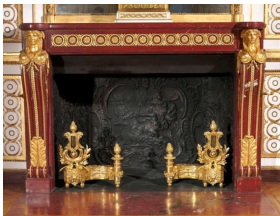
Fireplace of the Gilded Study, Palace of Versailles.